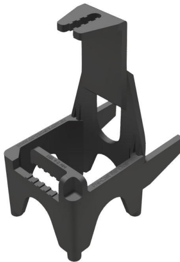
Pre-Cast Pile Bar Chair